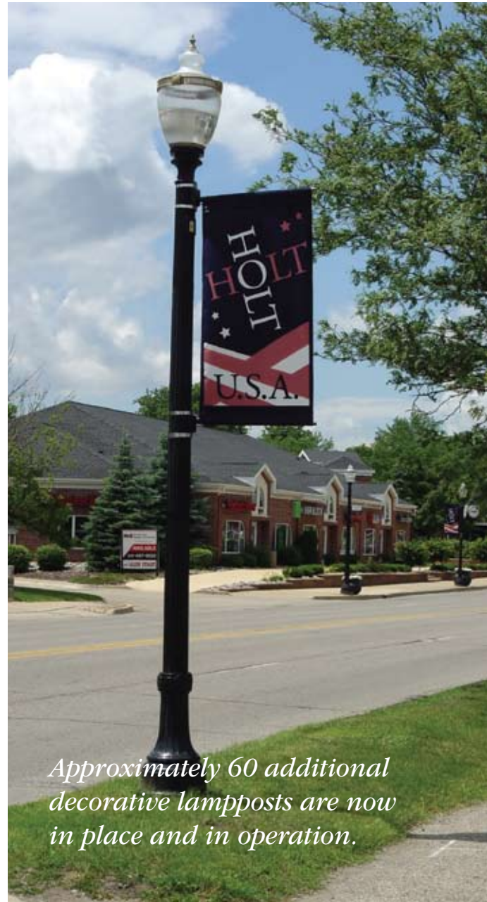
Approximately 60 additional decorative lampposts are now in place and in operation.

Approximately 60 decorative lampposts have been added to Cedar Street between Holt Road and Aurelius. By the end of summer, the last of the overhead utility poles will be removed from this section of Cedar.