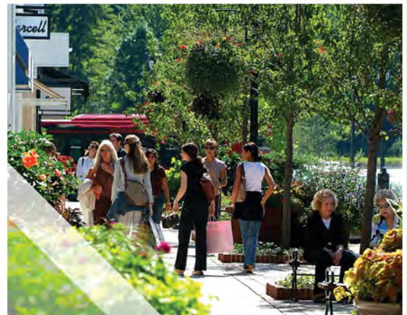
Proposed streetscape look and feel, once completed