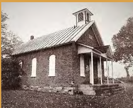
To learn more, check out the Holt, Michigan: A Slice of History Facebook page, or holtdelhihistoricalsociety.webs.com .