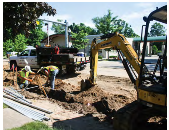
Construction underway opposite the Sam Corey Senior Center