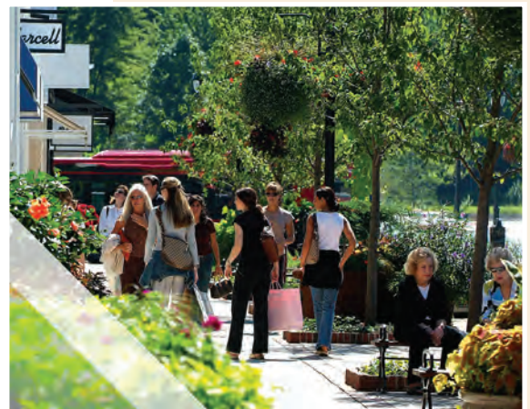
Proposed streetscape look and feel, once completed