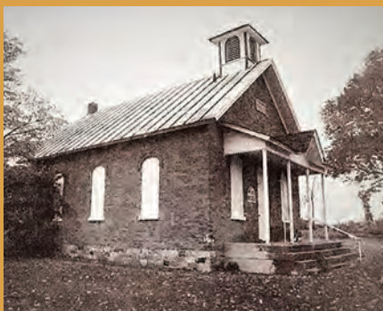
To learn more, check out the Holt, Michigan: A Slice of History Facebook page, or holtdelhihistoricalsociety.webs.com .