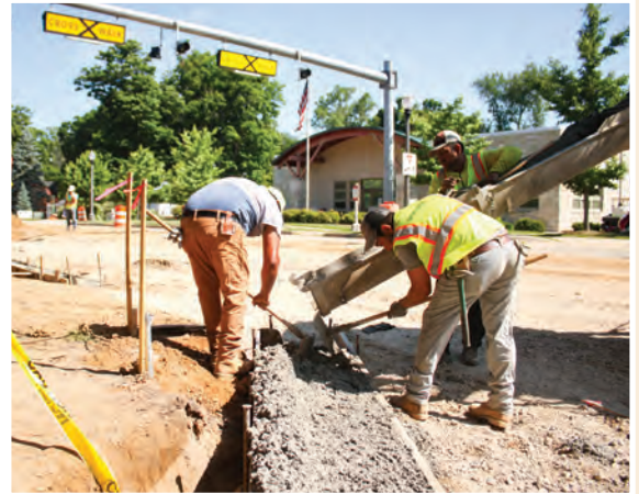
New concrete being poured for the curb and gutter

You can find more information, including construction updates, photos, and detour information on realizecedar.com or by visiting the Realize Cedar Facebook and Instagram pages.