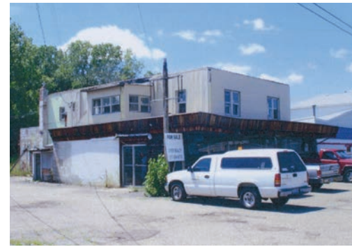
The Water Store before and after

The Delhi DDA is at 2045 North Cedar Street, Holt, 517.699.3866, www.delhidda.com .